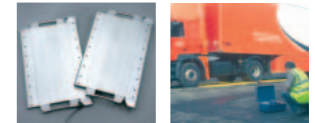
CHEKLODE DP IN MOTION WEIGHING