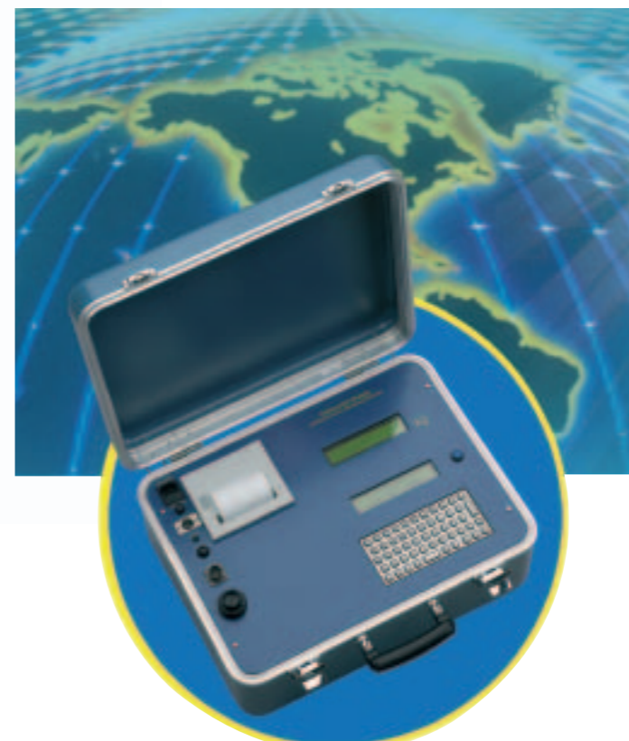
CHEKLODE DP CONSOLE