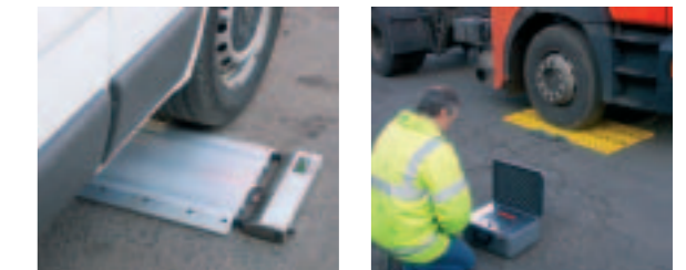
VANWEIGH AND FREEWEIGH RF