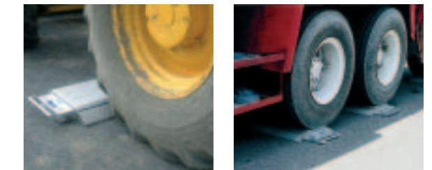
CHEKLODE PT STATIC WEIGHING