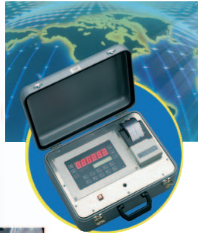
FREEWEIGH RF CONSOLE